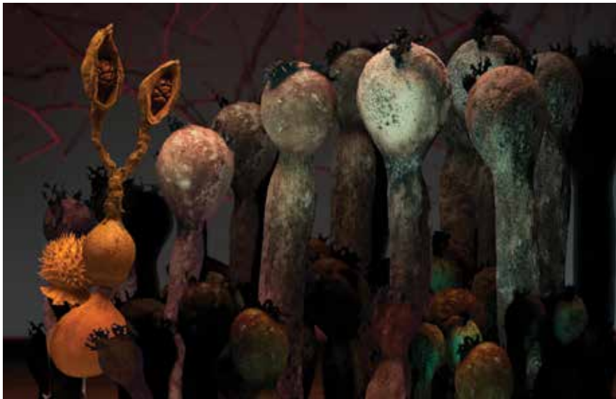
Greek Chorus Still frame from Radicles