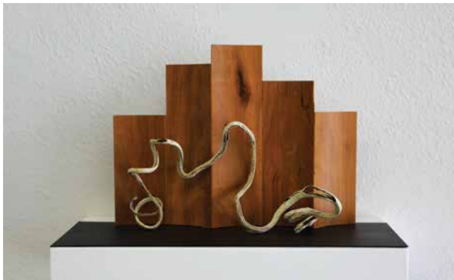
The Seaweed Museum