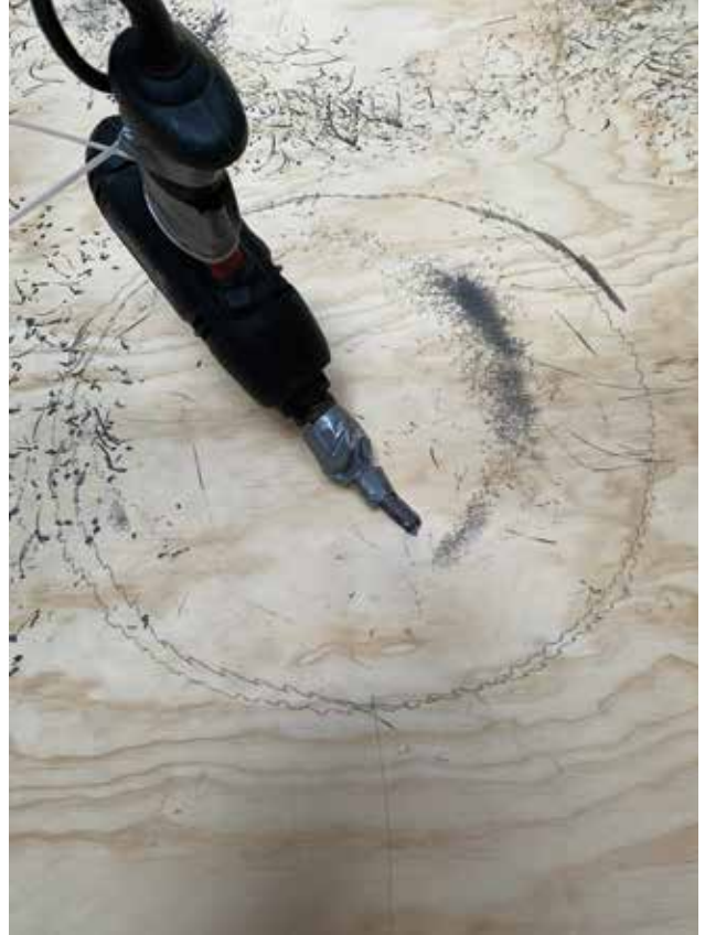
Still from Drill Drawing Machine