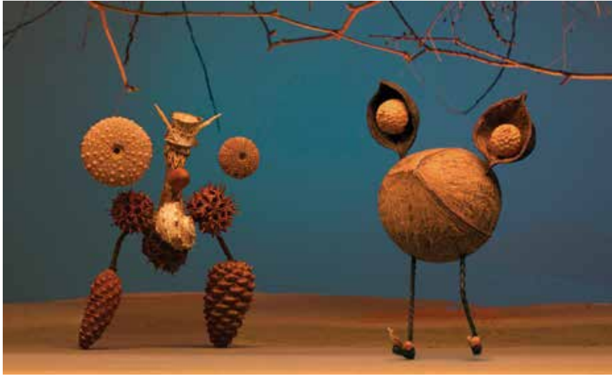
Shelly and Coco Bongo Still frame from Radicles