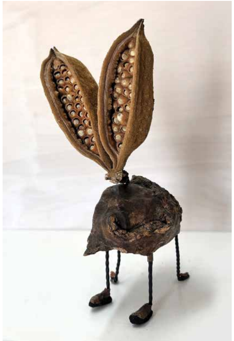
Iggetty Dawg Daddy

Ric Heitzman's stop-motion animated film, Radicles (still in production) is a poetic dreamscape inhabited by mysterious anthropomorphic figures. The handmade puppets and props are crafted from organic materials, including pine cones, shells, seed pods, twigs and kelp. His characters are expressive in movement, but are equally arresting as figurative sculptures. The film has a surreal beauty derived from the rustic nature of his materials and enhanced by shimmering lighting, a natural soundtrack, and sets, both analog and digital. In Radicles Heitzman has created a rich, imaginative world that is a compelling extraterrestrial experience.