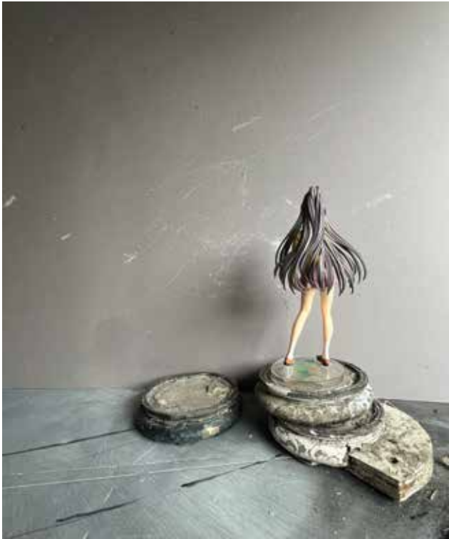
No Ideas but in Things 4