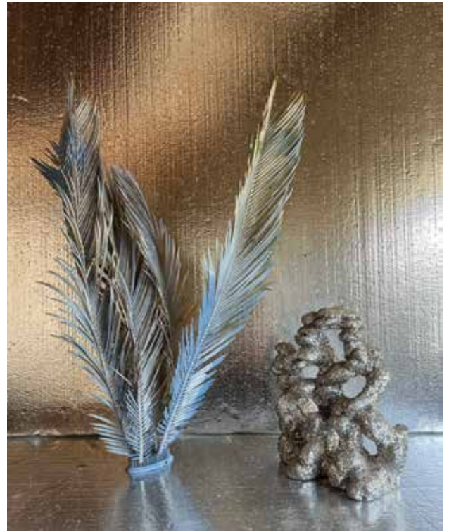
No Ideas but in Things 5