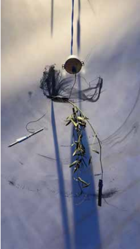
Still from Leaf Drawing Machine